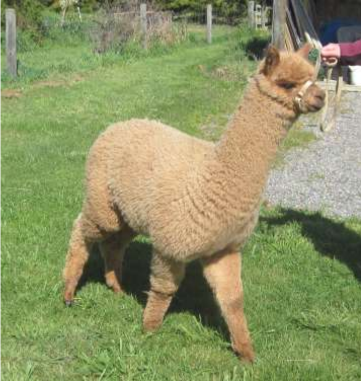
Foxtrot walking on a lead September 2018.