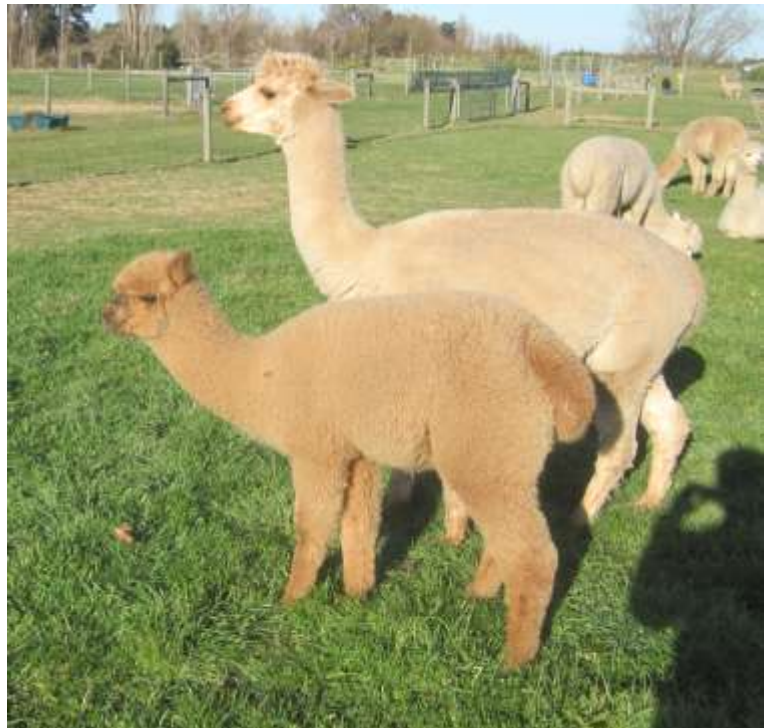
Foxtrot with her mum Franchesca September 2018