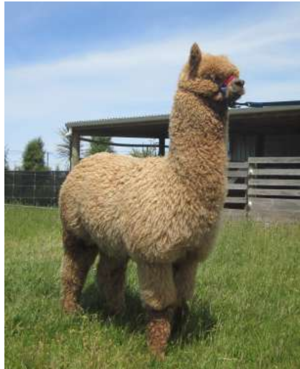
Madras as a young female