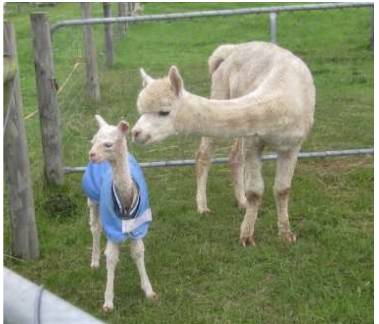
Pearl with her female cria Grace in March 2018.