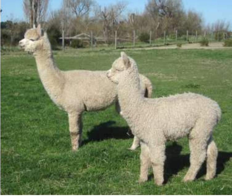
Pearl and her female cria Grace in September 2018